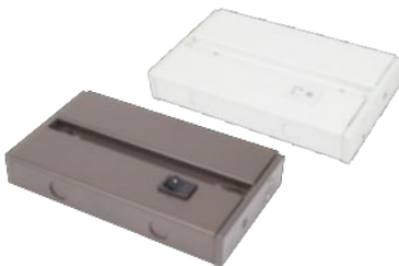
Hardwire Junction Box ALC-BOX-WH (White) ALC-BOX-DB (Dark Bronze)