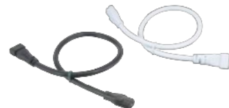
Linking Cables ALC-EX6-WH (6" / White) ALC-EX12-WH (12" / White) ALC-EX6-BK (6" / Black) ALC-EX12-BK (12" / Black)