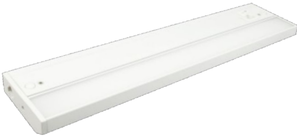
LED 3-Complete 2 - White 3LC2-8-WH (8" / 6.5W / 335Lm) 3LC2-16-WH (16" / 11W / 620Lm) 3LC2-24-WH (24" / 14.7W / 925Lm) 3LC2-32-WH (32" / 16.8W / 1088Lm)