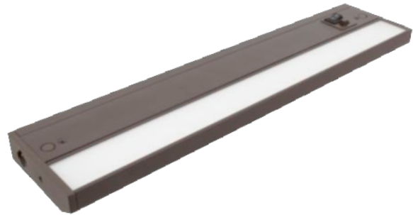
LED 3-Complete 2 - Dark Bronze 3LC2-8-DB (8" / 6.5W / 335Lm) 3LC2-16-DB (16" / 11W / 620Lm) 3LC2-24-DB (24" / 14.7W / 925Lm) 3LC2-32-DB (32" / 16.8W / 1088Lm)

3LC fixtures include: (1) 3/8" cable connector / (1) End-to-end linking connector / Captive mounting screws