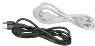
120V AC Power Cord (6ft) ALC-PC6-WH (White) ALC-PC6-BK (Black)